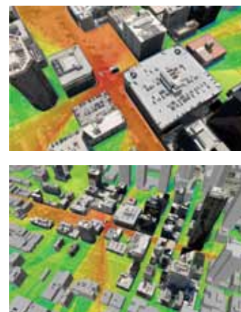
Images to the left: created using high-fidelity radio frequency propagation simulation within the simulated geospecific complex urban environment of Los Angeles, correlated and overlaid on Google Earth™.

SAIC is extending OneSAF to prepare users to face the real-world effects that occur with the loss or degradation of computer and communications networks in a cyber attack. Today, through integration of external products, OneSAF users can portray computer networks with high-fidelity simulation—from the emulation of network devices, protocols, users and attackers, to the physics of indoor and outdoor wireless network transmission and signal propagation in urban areas. OneSAF enables users to see the effects of threats and actions based on simulated, complex physical and behavioral environments. The reactions of actors in the real world can also be represented in the realistic organizational and physical entities provided by the OneSAF system.