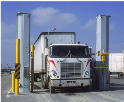
The Portal VACIS system scans containers with minimal impact on the flow of traffic.

Compact, high-throughput container imaging for ports and border crossings