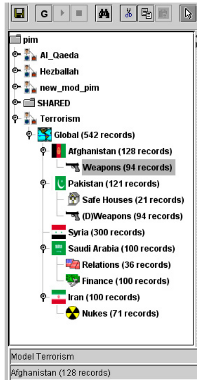
PIM Tree View

PIM provides two viewers. The model viewer provides a two-dimensional node and link diagram where each node contains stored records. The tree viewer provides a standard tree view (similar to a file browser) of the same model. The choice of viewer is a user preference and often depends on the type of problem to be modeled. The viewer can be changed at will without affecting the model.