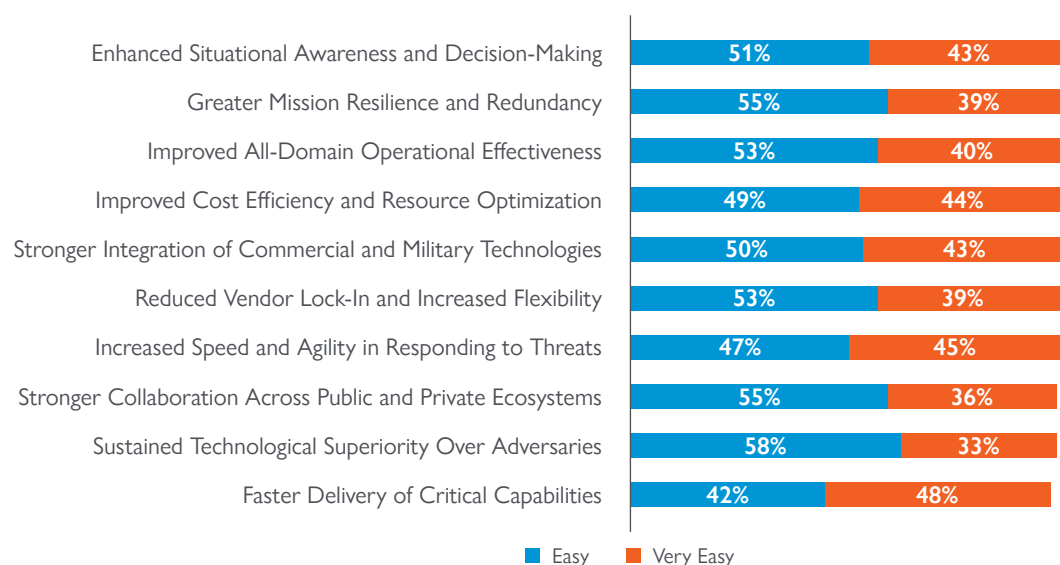
Figure 2: Outcome Ranked by Ease of Implementation

Among the ten outcomes, Defense and Intelligence leaders were most likely to rank enhanced situational awareness and decision-making as well as greater mission resiliency and redundancy (both 94%) as the outcomes easiest to implement. These were closely followed by improved all-domain operational effectiveness (93%). These results suggest a readiness and capacity for successful implementation among defense and intelligence leaders.