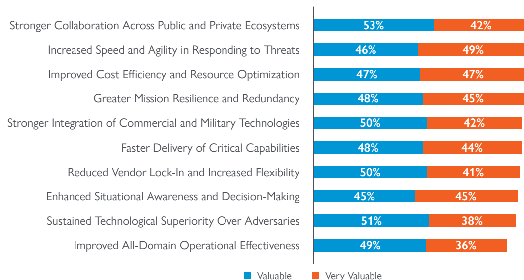
Figure 1: Top-Ranked Mission Integration Outcomes

Defense and Intelligence leaders reported that the five most valuable outcomes of mission integration are (in ranking order): stronger collaboration across public and private ecosystems (95%), increased speed and agility in responding to threats (94%), improved cost efficiency and resource optimization (93%), and greater mission resilience and redundancy as well as stronger integration of commercial and military technologies (both 92%). The top-ranked outcomes in Figure 1 would be most likely to drive the success of their organization and its mission. These findings support the high potential value that defense and intelligence leaders see in mission integration.